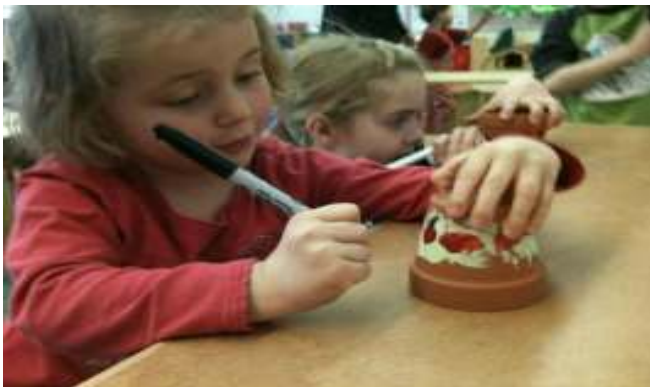
When it comes to Mother's Day gifts, you cannot concentrate enough - they are worth every effort!

The chocolate sales launch is complete! We have covered our costs and have made a modest profit!! We still have some chocolate that needs a good home, if you are able to help sell a few more boxes, please see someone in the office. Thanks everyone for your invaluable support of this fundraiser!