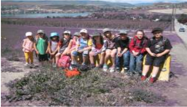
The School Age program we dressed and ready for adventure at Kal Park. With reports of rattlesnakes, we learned about making safe choices in our environment.

Summer Registrations are in and we recognize that there are varying childcare requirements from our families. We are working hard and are looking at ways to try to meet as many people's needs as possible. Stay tuned.